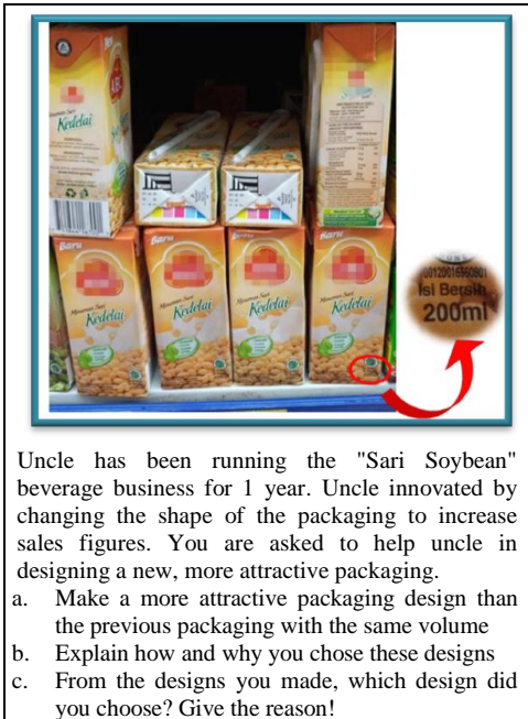
Figure 1. Math Problem