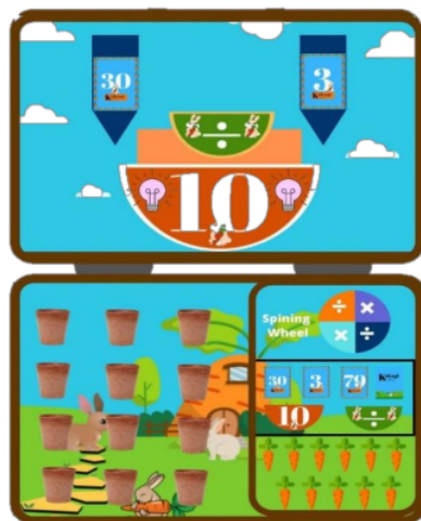
Figure 3. Subject Results in Constructing the KoKagi Ke Wort props

The subject makes his own learning media that is different from the previous media. Based on the results of observations of learning situations, interviews with mathematics teachers, analysis of existing materials and teaching aids, the subject constructed the KoKagi Ke Wort teaching aids. This teaching aid consists of question cards, answer cards, times or division indicator cards, spinner wells which are used as indicators for multiplication or division questions, carrots and pots as concrete objects to solve problems, and true or false indicator lights. If the student answers correctly then the green light will turn on, but if the student's answer is wrong then the red light will light up. The subject's creativity in developing learning media in the form of the KoKaGi Ke Wort teaching aid is the ability to modify learning media into new and useful forms (Syaikhudin, 2013). The subject made KoKagi Ke Wort props based on modifications of existing learning media by equalizing the procedures for using props based on the concepts of multiplication and division and shown in Figure 3.