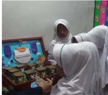
Figure 4. Subjects and Student Groups Study Multiplication and Division Materials through the KoKagi Ke Wort Trainer Tool

The subject applied the KoKagi Ke Wort teaching aid "Konsep Kali Bagi Bersama Kelinci & Wortel" in learning mathematics on multiplication and division of integers at MI Al-Mujahidin Parimono Class 2 Ar-Rosyid. Through the application of learning media, the subject creates student activity by forming groups. Each group consists of 3-4 students. The subjects gave the KoKagi Ke Wort tool to each group, so that each group could learn multiplication and division together as shown in Figure 4.