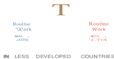
Figure 1. The position of creativity

through the learning process of any fields of study [9]. Figure 1 says that creativity takes place at the top.